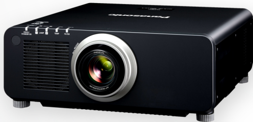
PT-DZ870 The 8000 ANSI Lumens Projector Compatible with the DLE030 Ultra Short Throw Lens