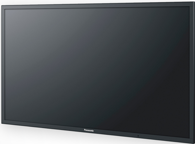
84" 4K LED DISPLAY The New 84" 4K LED Display