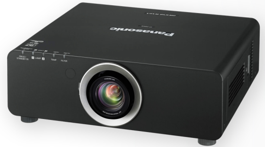
PT-RZ670 The New 6000 ANSI Lumens Solid Shine Projector