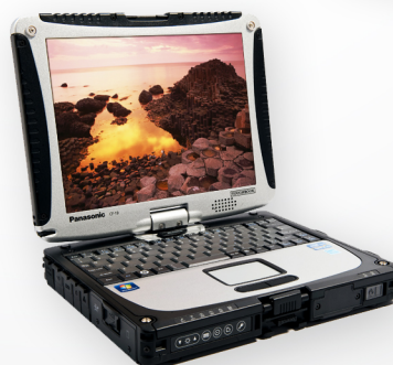
ToughBook CF-19 The Market-Leading, Touch and Rotating Screen Convertible Notebook, which sets the Benchmark in Ruggedness