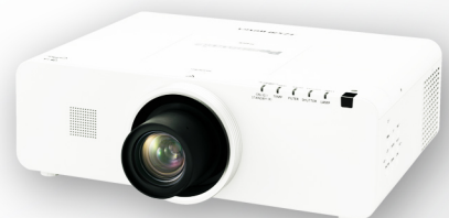
PT-EZ580 The New EZ580 5,400 ANSI Lumens Projector with WUXGA Resolution