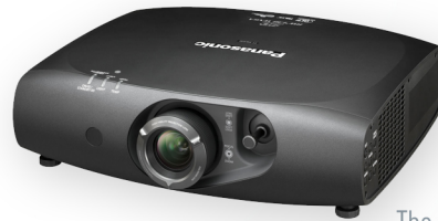
PT-RZ470 The Award Winning PT-RZ470 Solid Shine Projector