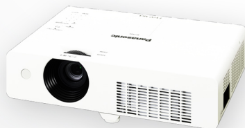
PT-LB360 The New 3,600 ANSI Lumens Compact and Portable Projector